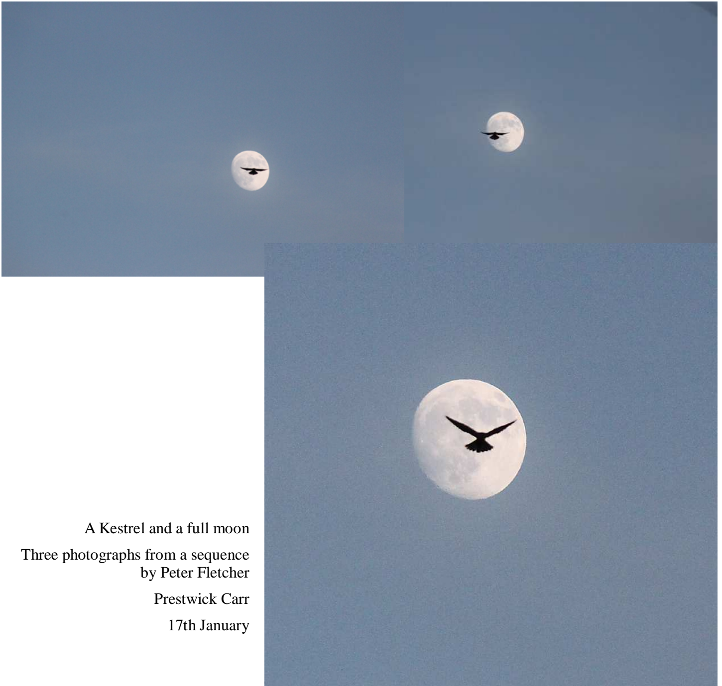
A Kestrel and a full moon

Up to three birds were noted regularly on Holy Island during the month (IK); two were seen at Cramlington, East Chevington, Fenham-le-Moor, Ross Village and Seaton Delaval. 44 records of single birds were received.