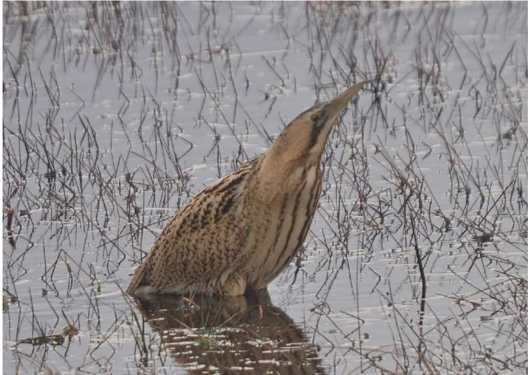
A striking pose from the Druridge Pools Bittern 13th January by Tim Dean

Two were at Gosforth Park NR on 8th (IK per SRB) and a single was seen there on several dates during the month. Singles were at East Chevington on 2nd/12th (MH/AA), Cresswell Pond on 8th/27th/29th/30th (CB/ADMc/ASH), Druridge Pools on 13th (TRD/JD), QEII Lake on 21st (RHAr/MAR) and Woodhorn Flashes on 26th (PRM).