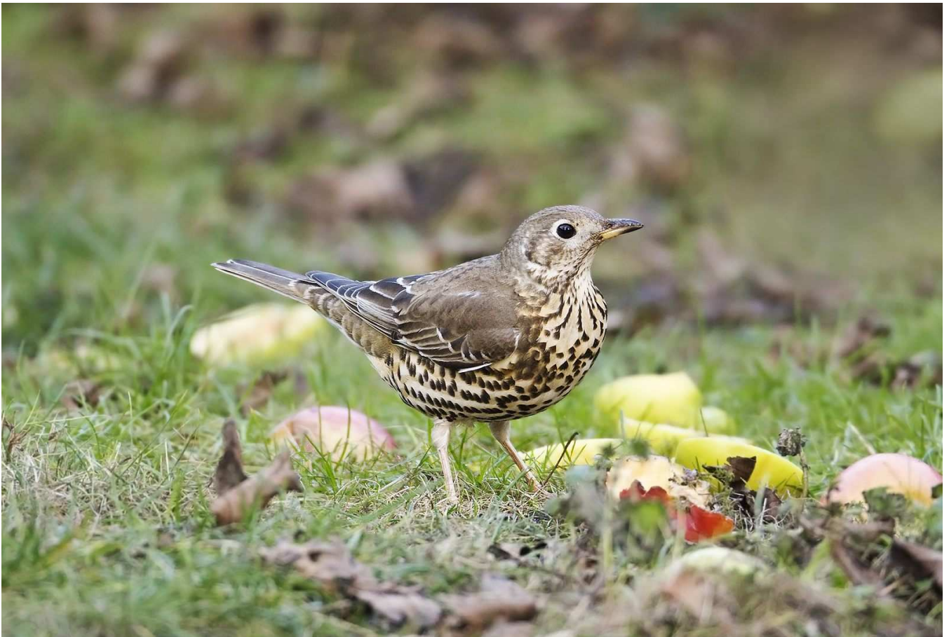
A handsome Mistle Thrush at Tynemouth by Colin Bradshaw

Very scarce this month, the highest count 42 at Northumberland Park (North Shields) on 19th (MCN). Lesser numbers 20-25 were also reported from Blyth (Meggie's Burn), Capheaton, Earsdon, Scots Gap and Tynemouth and 11-15 from Killingworth village, Ouseburn Park, Walbottle / Blucher and Woodhorn Flashes. Up to ten were reported from a further 12 localities.