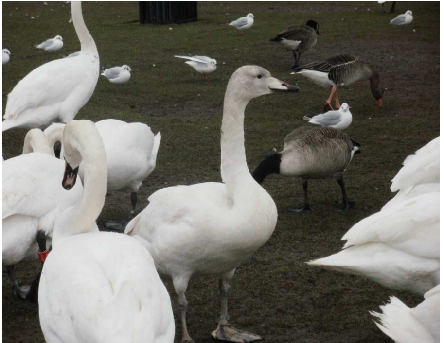
A juvenile Whooper with Mute Swans QEII Lake on 26th January

Five flew N at Southfield Lea (Cramlington) on 2nd (DM) and two flew over High Heaton (Newcastle) on 24th. By far the largest gathering was 167 taking off from QEII Lake just after dawn on 16th to feed in fields to the north of the lake (CDH). Other gatherings were 43 at nearby Woodhorn on 21st (RHAr//Mar), 36 at Capheaton on 19th (STE), 32 in the Tweed Estuary on 14th, 12 at Mount Carmel (Norham) on 23rd (MHu) and ten at Leazes Park (Newcastle) on 24th (DM). One to nine were at Arcot Pond, the Blyth Estuary, East Chevington North Pool, Elswick Wharf, Exhibition Park (Newcastle), Grindon Lough, Hauxley, Linton Pond, Newcastle Quayside, Ovingham, West Hartford and Whittle Dene Reservoirs.