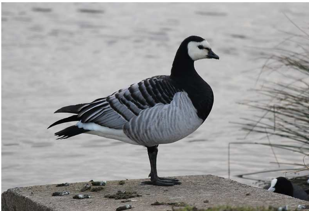
Barnacle Goose at QEII Lake on 27th January

On 8th a group of 14 was on the north side of Budle Bay (TRD/JD). Two were in the Woodhorn/QEII Lake area from 1st-16th with one present until 27th (DM/STH/PJA et al. ).