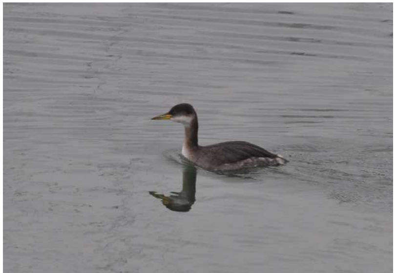
A Red-necked Grebe Blyth South Harbour 27th January by Tim Dean

Three were off Ross Back Sands on 17th (MSH). A well-watched bird was in Blyth South Harbour from 5th-31st (BB et al. ).