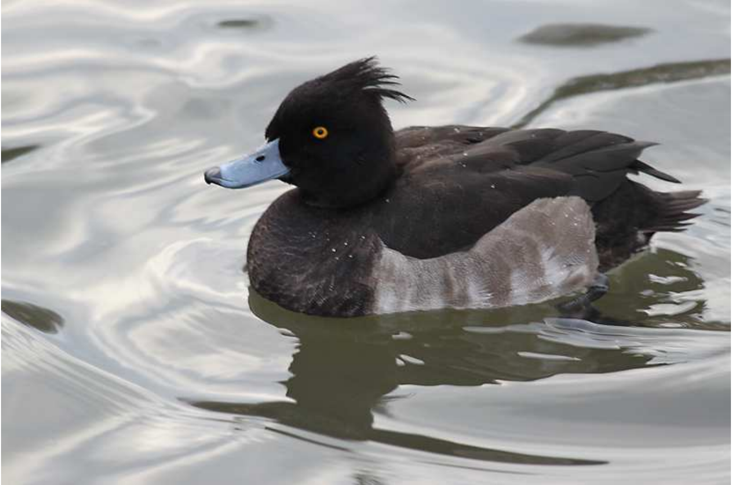
Tufted Duck at Killingworth Lake 3rd January

Killingworth Lake held peaks of 134 on 16th (LJM) and 118 on 27th (IF), 87 were at Ladyburn Lake on 25th (MSH), 72 at Marden Quarry on 15th (KWY), 46 at QEII Lake on 16th (CDH), 40 at Capheaton Lake on 19th (STE), 31-38 at Linton Ponds, Newcastle Leazes Park, and Whittle Dene Reservoirs, 13-20 at Castle Island, East Chevington, Holy Island Lough, Newcastle Exhibition Park, West Allotment Pond and Woodhorn Flashes. One to seven were also at six further sites. Less typical were 22 at Bates Minewater Treatment Plant (Blyth) on 2nd (MSH), four at the Tweed Estuary on 14th (MHu), three at Tweedmouth Dock on 2nd and two on 23rd (MHu), and singles at the Blyth Estuary and Spittal Bay.