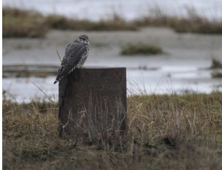
A Merlin at Holy Island on 23rd January

A juvenile and a female were noted regularly on Holy Island (IK) and two were seen at Fenham Slake on 16th (IBDa/KDa). Single birds were seen at nine further coastal locations (ADMc et al. ).