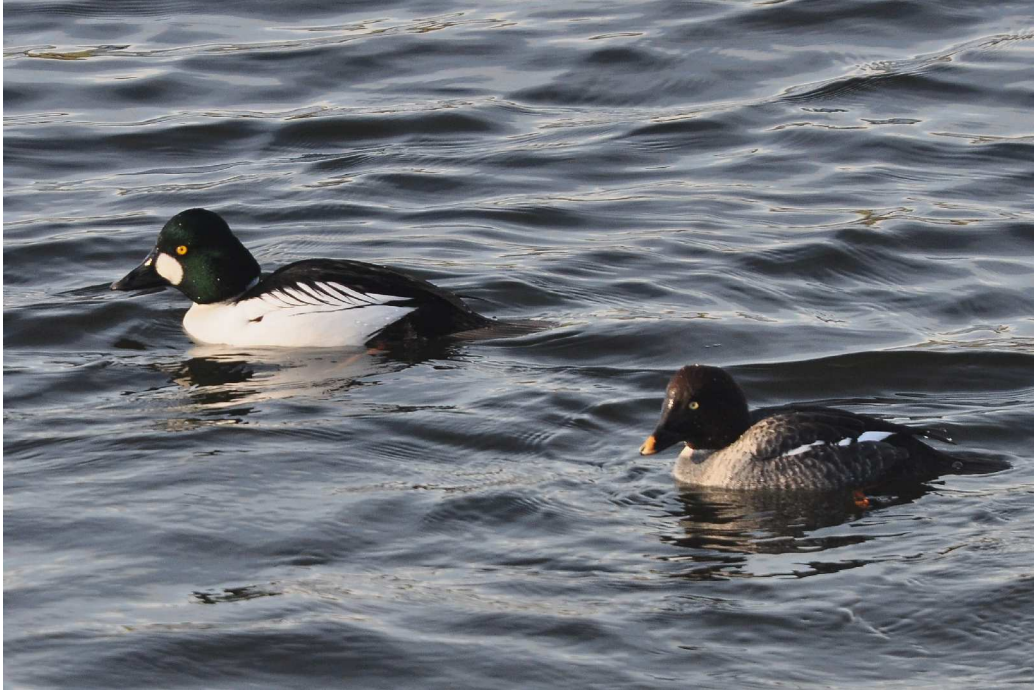
A pair of Goldeneye at Caistron 21st January

The largest concentrations were 158 at the Tweed Estuary on 14th (MHu), 122 at Beadnell Bay on 2nd (ASJ), 54 at Caistron on 21st (TRD), 36 at Capheaton Lake on 19th (STE), 32 at Low Newton on 18th (TRD/JD), 28 at QEII Lake on 16th (CDH), and 22 at West Ord on 23rd (MHu). Counts of ten to 17 came from Branton GP, Castle Island, East Chevington, Killingworth Lake, Seahouses and Whittle Dene Reservoirs, five to nine at Big Waters, the Blyth Estuary, Fisherman's Haven, Grindon Lough, Horncliffe, Howick, QEII Lake, St Mary's and Wylam, and three to four at Dodd's Well (Berwick), Hauxley Reserve, Hipsburn, Ladyburn Lake and Newton Pool. One to two were at 12 further sites.