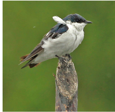
White-winged Swallow ( Andorinha-do-rio ) Tachycineta albiventer

At the Aldebaran private estate we caught up with a Rufous-bellied Thrush ( Sabiá-laranjeira ) Turdus rufiventris , which appeared just as interested in us.