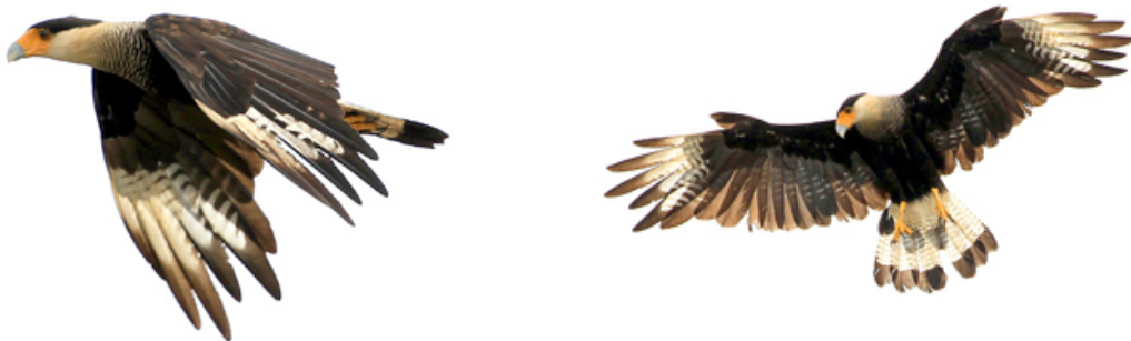
Southern Caracara (Caracara) Caracara plancus

We recorded one Hawk; a Roadside Hawk (Gavião-carijó), Rupornis magnirostris and three species of Falcons. We regularly experienced great views of Southern Caracara's, which are common throughout Alagoas .