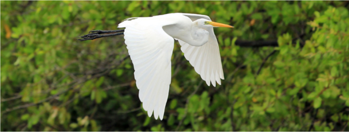
Great Egret ( Garça-branca-grande ) Ardea alba

The following is a summary of our recent visit to Alagoas, which is a state in the north east of Brazil. By far the most entertaining days were our boat trips to two Lagoons, both of which were only a short drive from Maceió city centre, the capital of Alagoas. These were ' Lagoa Mundaú ' and ' Lagoa Manguaba '. The highlights were always the magnificent Egrets of which there were three species present. The most common was the giant, Great Egret.