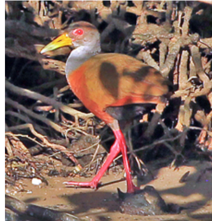
Gray-necked Wood-Rail ( Saracura-três-potes ) Aramides cajanea