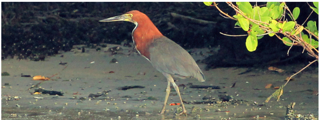
Rufescent Tiger-Heron ( Socó-boi ) Tigrisoma lineatum

The most impressive however included the Rufescent Tiger-Heron , which we were lucky to find at ' Lagoa Manguaba '.