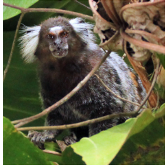
Marmoset Monkey's at the Aldebaran private estate.

We recorded one species of Swift; this was the Fork-tailed Palm Swift ( Andorinhao-do-buriti ) Tachornis Squamata which we caught up with at the airport at Rio De Janeiro.