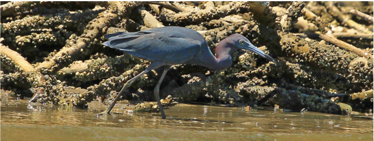
Little Blue Heron (Garça-azul) Egretta caerulea

We also experienced amazing views of the colourful Little Blue Heron at both Lagoons.