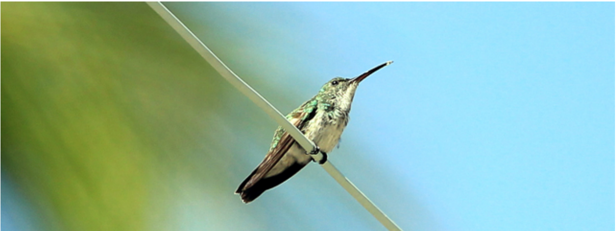
Plain-bellied Emerald ( Beija-flor-de-barriga-branca ) Amazilia leucogaster

In Maceio we regularly observed Swallow-tailed Hummingbird ( Beija-flor-tesoura ) Eupetomena macroura and Plain-bellied Emerald ( Beija-flor-de-barriga-branca ) Amazilia leucogaster and on one occasion a Glittering-bellied Emerald ( Besourinho-de-bico-vemelho ) Chlorostilbon lucidus