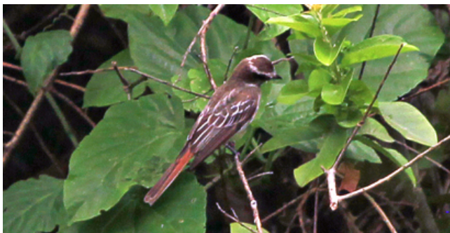
Variegated Flycatcher ( Peitica ) Empidonomus varius trip to private village.

We also recorded an ninth at the 'Murici Atlantic Rainforest ; a White-headed Marsh Tyrant ( Freirinha ) Arundinicola leucocephala , and a tenth a Variegated Flycatcher ( Peitica ) Empidonomus varius during a trip to the Aldebaran private estate.