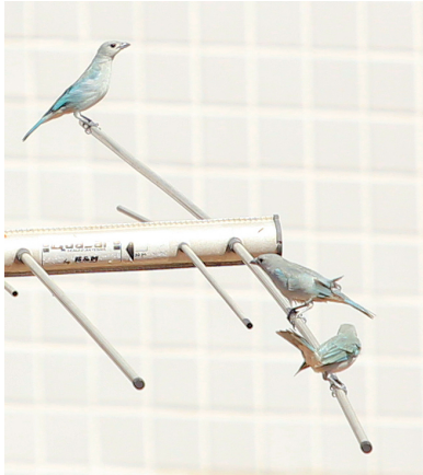
Sayaca Tanager (Sanhacu-cinzento) Tangara sayaca