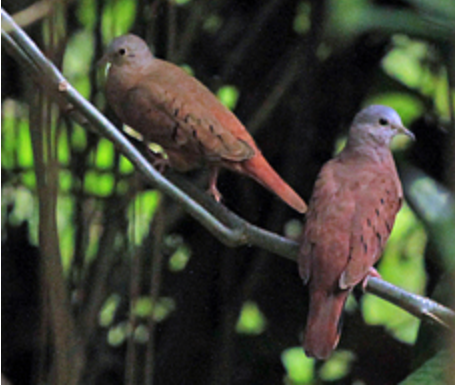
The most common is the Ruddy Ground Dove ( Rolinha-roxa ) Columbina talpacoti .

Not far from Maceió we found a group of Red-shouldered Macaw ( Maracana-pequena ) Diopsittaca nobilis and at the Muricic Atlantic Rainforest a flock of Blue-winged Parrotlet ( Tuim ) Forpus xanthopterygius . Also at the rainforest we recorded two members of the Cuculide family; a Squirrel Cuckoo ( Piaya caynana ) and lots of Smooth-billed Ani ( Anu-preto ) Crotophaga ani