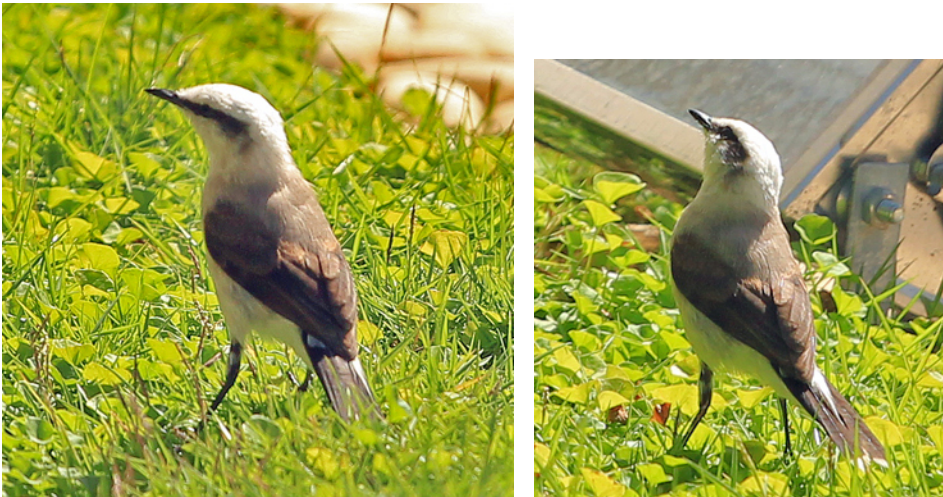
Masked Water-Tyrant ( Lavadeira-mas-carada ) Fluvicola nengeta .

Eight members of the Tyrannidae family were common throughout Alagoas and were also a pleasure to watch. These included: Yellow-bellied Elaenia ( Guaracava-de-barriga-amarela ) Elaenia flavogaster , the legendary Bem-te-vi , the Great Kiskadee ( Bem-te-vi ) Machetornis rixosa , Cattle Tyrant ( Suiriri-cavaleiro ), Machetornis rixosa , Boat-billed Flycatcher ( Neinei ) Megarynchus pitangua , Social Flycatcher ( Bentevizinho-de-penacho-vermelho ) Myiozetetes similis , Tropical Kingbird ( Suiriri ) Tyrannus melancholicus , Tropical Pewee ( Papa-moscas-cinzento ) Contopus cinereus and the friendly Masked Water-Tyrant ( Lavadeira-mas-carada ) Fluvicola nengeta .