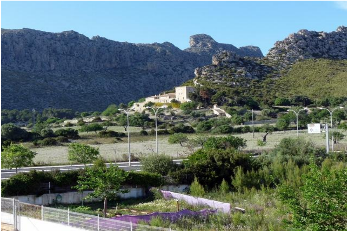
The view from our apartment with the Boquer Valley on the doorstep

Having been to the island on previous occasions this was never a 'full on,- see you at the evening meal ! ' birding trip, rather I aimed to get to grips with some of the endemic subspecies and my time in the field was confined to several hours early morning and again early evening at a fairly relaxed pace. The following locations were visited:-