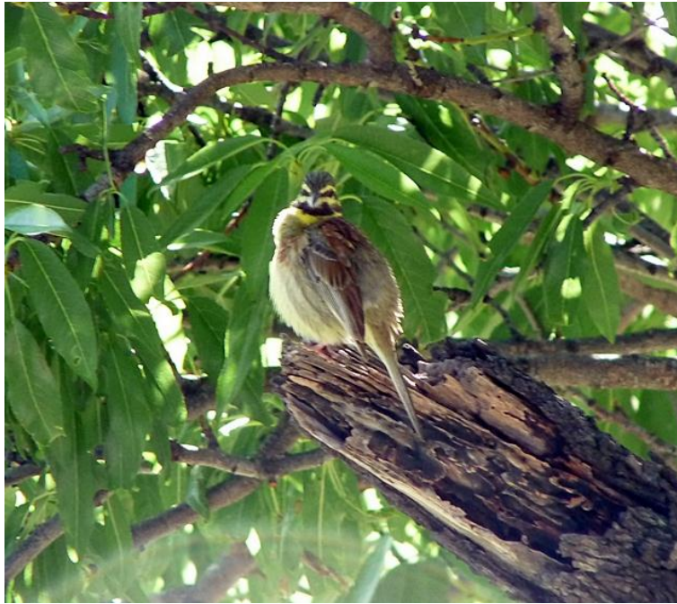
Corn Bunting: - Miliaria calandra – Widespread with at least two singing at base of Boquer Valley