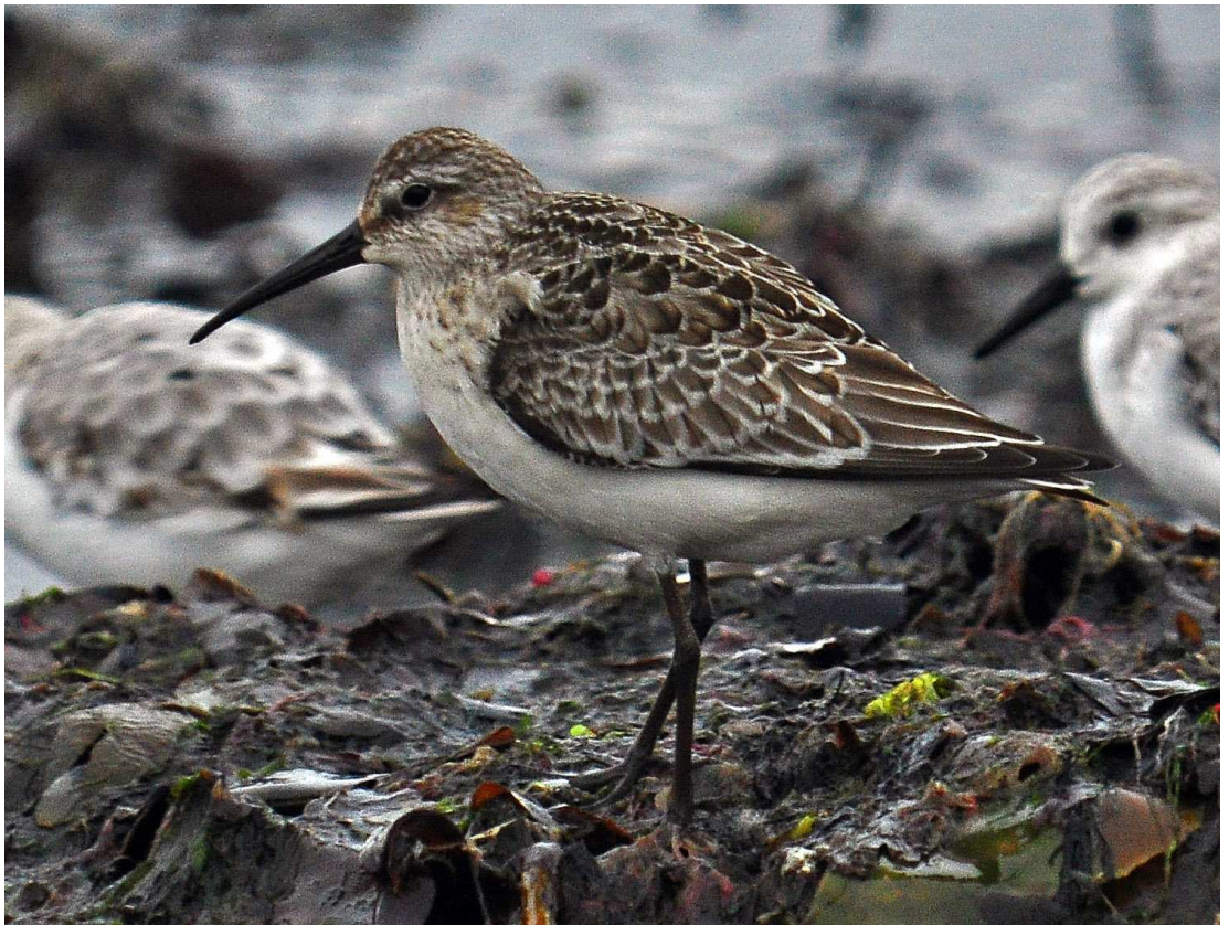
A Curlew Sandpiper St. Mary's 5th September Jack Bucknall

An estimated 300 were at St Mary's on 5th (SPP) with 120 there on 7th (JPD) and 210 on 19th (ASJ). Berwick North Shore had 80 on 18th (MHu) and the most at Hauxley was 25 on 11th. Eight were at Cocklawburn on 12th and five or fewer were at a further five typical locations.