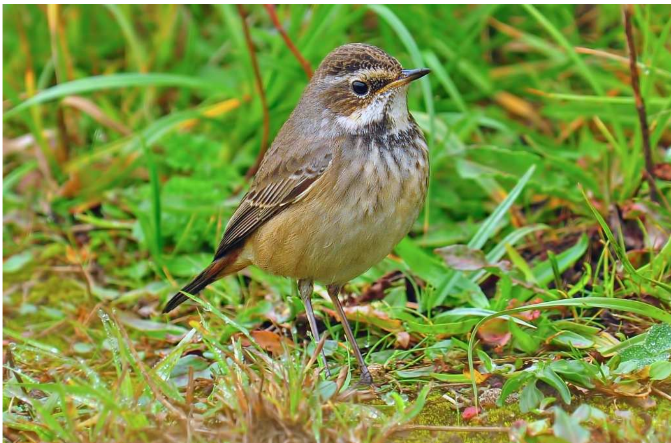
The much visited Bluethroat at St. Mary's 25th September

A female / juvenile was at St Mary's Island from 25th-28th (SPP/PRM et al. ).