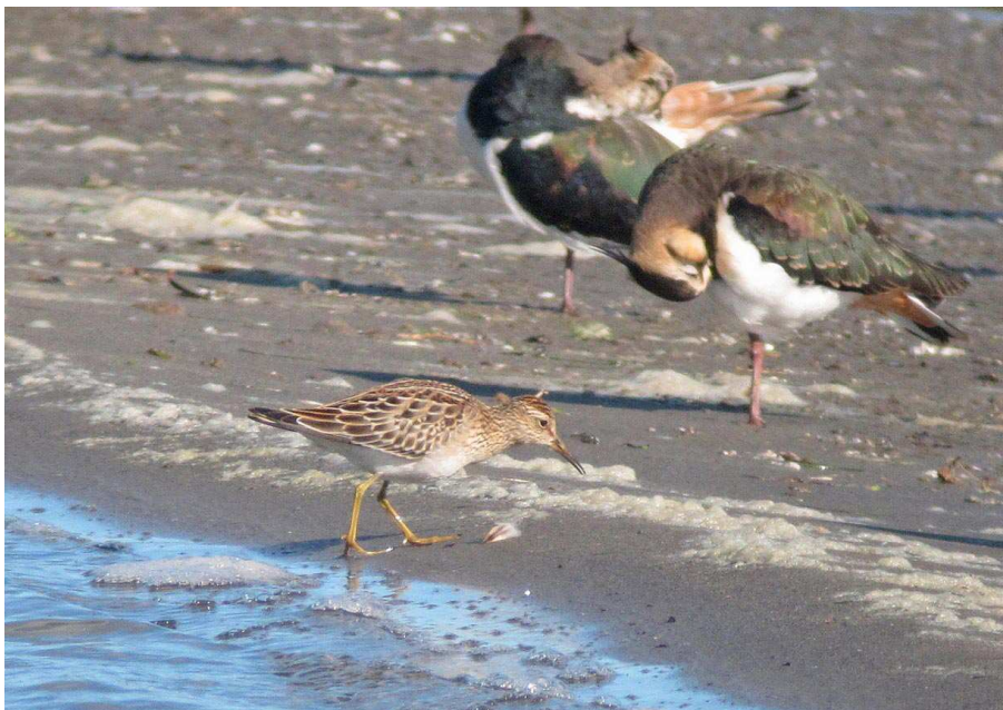
Pectoral Sandpiper Cresswell Pond Jonathan Farooqi 22nd September

Two juveniles arrived on 4th: one at Grindon Lough remaining to 8th (PRM) and one at East Chevington staying to 5th (JPD/MPF/AS et al. ). A juvenile visited Bothal Pond on 9th (TF/JFa) and another was at Cresswell Pond on 22nd (ADM et al. ).