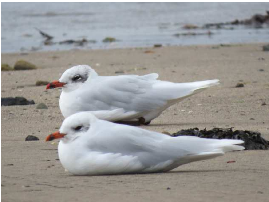
Mediterranean Gulls at Newbiggin by Alan Jack

The two Woodhorn Flash ponds held a total of 21 on 1st (ASJ) and the maximum number recorded at the favoured Newbiggin South Bay was 17 on 17th (STH); at the latter locality, seven on 13th comprised four adults, one 2nd-winter and two 1st-winters (TRD/JD). Elsewhere, one-two were noted at Berwick North Shore, Big Waters, Blyth Harbour, Budle Bay, Cresswell Pond/Snab Point, QEII CP, St Mary's Island and Whitley Bay GC.