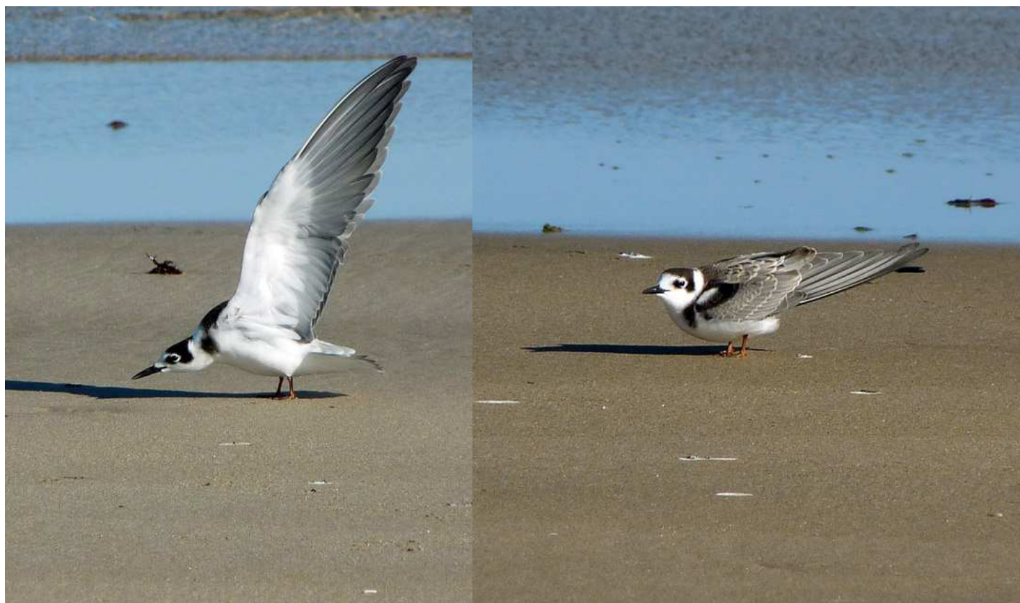
A Black Tern at Budle Point by Chris Knox 21st September

Four flew N at Tynemouth on 7th (SPP). Three-four juveniles roosted at Budle Point on 21st/22nd (CGK) and single juveniles were at nearby Bamburgh Stag Rocks on various dates from 8th-21st (IBDa/KDa/TRD/JD/BRS). Elsewhere, singles were at East Chevington on 7th (SRB/TF/JFa/ADM), on an Amble pelagic trip on 8th (AC) and Emmanuel Head (Holy Island) on 10th (SR).