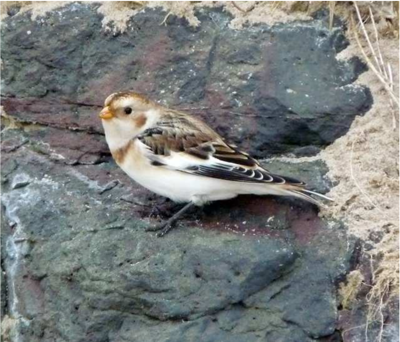
A Snow Bunting at Budle Point

The first returning birds were singles at Holy Island North Shore on 13th (IK) and a female on the beach at Warkworth Gut on 14th (NFO). Four were at Newbiggin Beacons on 26th (ADMc/AT) and singles were at Seaton Sluice Watch Tower on 23rd (SSWT) and Whitley Bay on 25th (ASJ).