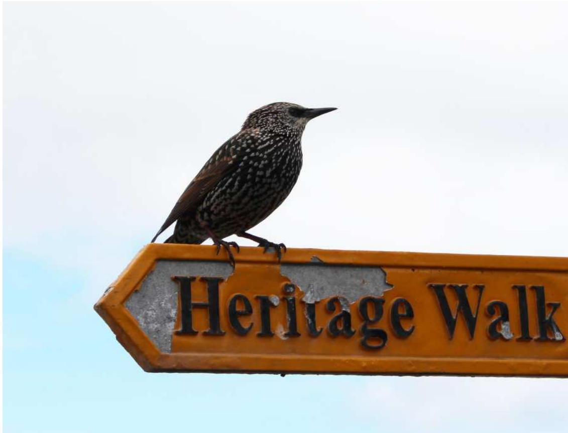
A Starling at Seahouses by Steve Barrett on 12th September

The highest of six counts from Grindon Lough from 4th-9th was 362 on 7th (SJH et al. ). There were also 200 at West Stonefolds on 7th (JMA), 100+ at Prestwick Carr on 5th, 90 at Catton on 20th, 75 at Carrshield, Cullercoats and Newcastle (Town Moor) and 50 at Housesteads. Three to 30 were noted at a further four localities.