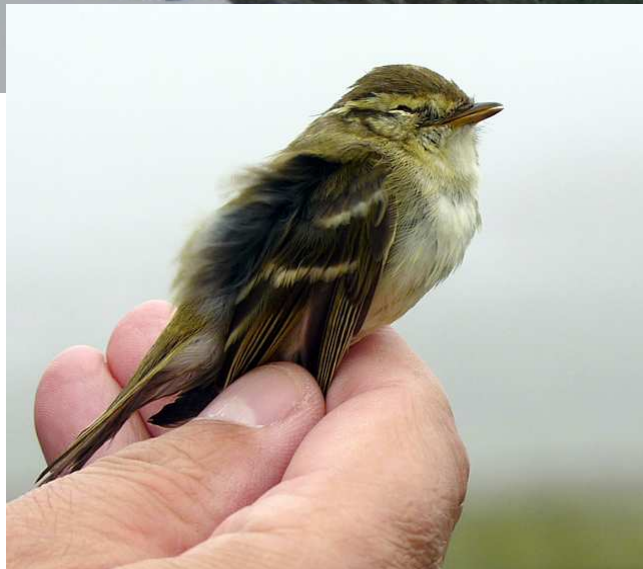
Two Yellow-browed Warblers on 25th September at St. Mary's

Top on a wet railing by Alan Janes and right one found dead by Chris Knox