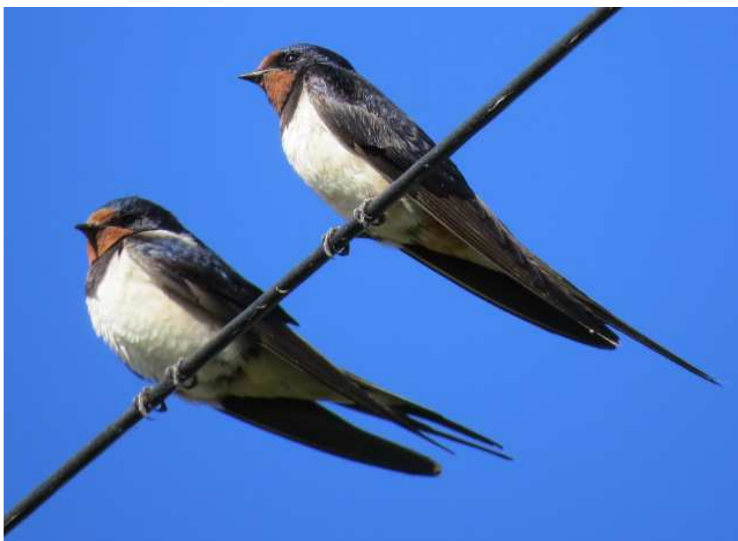
Swallows at St. Mary's on 13th September

A large roosting flock at Holywell Pond on 3rd was estimated at 6,000+ (MSH/CS/CGK) dropping to 2,000+ on 5th but re-building to 3,000+ on 7th as passage continued. The roost at Big Waters was 600 on 3rd and 500 on 4th (GB) with 300+ feeding or drinking at Longhirst Flash on 22nd (TD) and 220 on wires at Black Heddon on 5th (ASJ). Counts over 100 came from Druridge Pools, Great Whittington, Otterburn, Prestwick Carr and Wark with 14-80 from eighteen widespread localities and one to ten from a further seven. A poor breeding season was reported from Holy Island where 40 pairs fledged ca.115 young, one pair hatching six! (IK). Late young were noted at Powburn Café, three on 5th (JMA) and Cottonshope Head (Otterburn Ranges), four on 15th (JR) with the last sighting being three on the 29th at Holy Island. (STH).