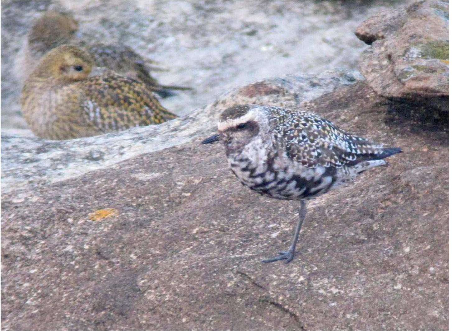
The popular American Golden Plover at St. Mary's 20th September

The high-tide roost at Guile Point (Lindisfarne NNR) held the largest group by far, with 500 counted on 20th (IK), whilst at nearby Budle Bay some 140 were noted on 22nd (CGK). In the south 68 were at St Mary's on 12th (ASJ) and 49 at Hauxley NR on 4th (JPD). Counts of 20 to 22 came from Berwick North Shore and the Tweed Estuary mid-month (MHu) whilst single-figure reports came from the Blyth Estuary, Cramlington and Whitley Bay, with a further single remaining inland at Derwent Reservoir on 28th (IFo).