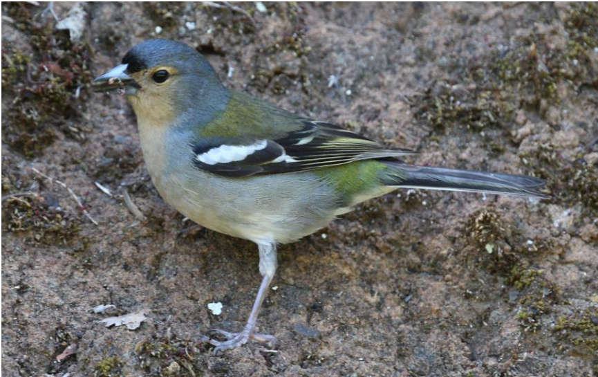
Madeiran Chaffinch at Balcoes

After getting back to the hotel another trip out to Ponta de Lourenco in the late afternoon was rewarded with a much quieter track as a result of most walkers having finished and a large flock of Canaries, Goldfinch and Berthelot's Pipit also revealed several Rock Sparrow, one determinedly pursuing a Hummingbird Hawkmoth across the rock face.