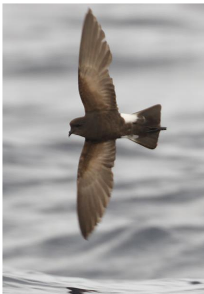
(left) Wilson's Storm Petrel at sea