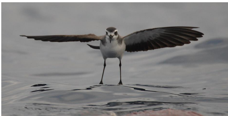
White-faced Storm Petrel

Madeiran Storm Petrel's flew across the boats path. A pod of playful Common Short-beaked Dolphin halted the return trip while a Flying Fish flew over the boat just after dark !