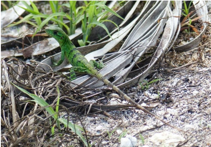
Juvenile Green Iguana