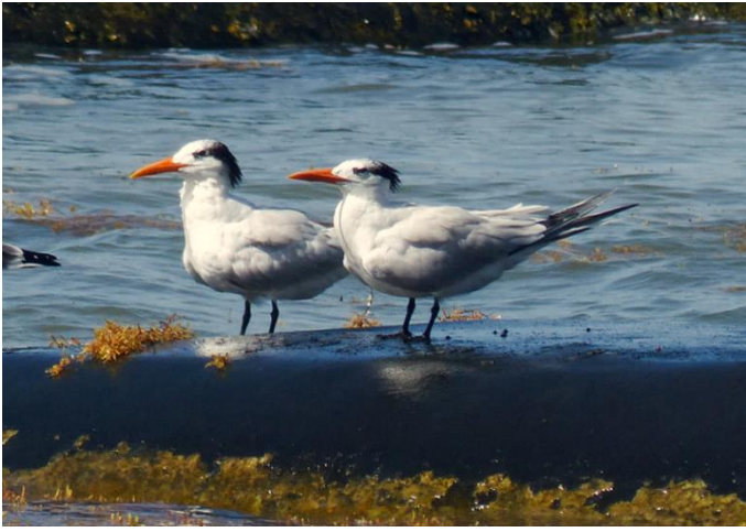
Pair of Royal Terns