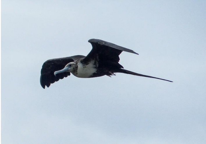
Magnificent Frigatebirds – superb!