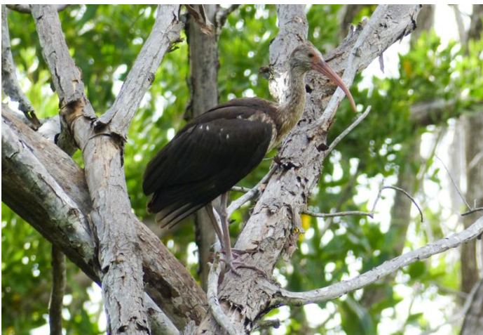
Juvenile American White Ibis

Keen to get back to the viewpoints I'd found the day before, after breakfast I left Laura on the sunbed, and headed out for more exploring. The birding was similar to the day before, but it felt exciting as new birds seemed to be coming and going all the time, especially from the forest area. Whilst photographing a Great Kiskadee , a larger bird flew over my head, landing briefly in a distant tree, before vanishing. I managed to fire off some record shots, and on consulting my bird guide, it turned out to be a Scaled Pigeon , not a species I'd expected to see, so that was most welcome. A juvenile American White Ibis showed very well here for a while, allowing me to photograph it. Walking back towards the apartments, I called in again at the swamp viewpoint, which was very productive. Two Tricoloured Herons were fishing here, as was a Green Heron very close to the viewpoint, seemingly undisturbed by my presence. Both species posed nicely for photos, before I headed back to the sunbeds! When I got to the beach, I had a scan through the regular roost of gulls and terns, and picked up two Royal Terns on a nearby raft, which were the first of the trip, as was a single Great Blue Heron , which was seen subsequently on most days after that.