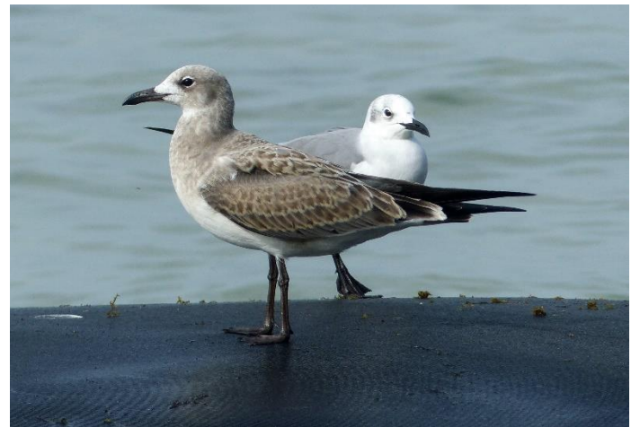
Juvenile Laughing Gull