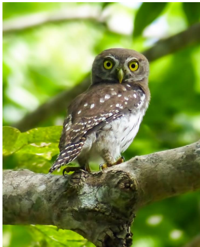
Ferruginous Pygmy Owl – the first bird we saw here!

The next destination was just over the road from Chunyaxché, an archaeological site called Zona Arqueológica de Muyil. Steven paid for our entry, and we had a slow walk through the trees near the visitor centre. This site was good to visit second, as the cover of the trees gave some relief from the heat of the mid-morning sun. More or less as soon as we'd entered the site, we stopped at Steven began whistling a call – I didn't know what to expect, but I soon found out, as almost instantly, a Ferruginous Pygmy Owl flew in and landed just metres away from us. Steven explained that these birds are active through the day, but it amazed me no less! We left the Owl in peace, and we had only taken a few steps away from it, when I got my eye on a Woodcreeper sp. flying over the path and landing on the side of a nearby tree. It was massive compared to Eurasian Treecreeper, and I was soon told it was an Ivory-billed Woodcreeper . It showed well but briefly, and frustratingly too quick for the camera. I would've loved a shot of it, as they are brilliant looking birds. We moved further into the reserve, passing two Howler Monkeys sleeping in a tree just off the main path! A Black-headed Trogon was also calling as we left the car park, which we saw briefly. Olive-throated Parakeets were again common here.