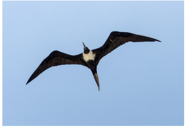
Magnificent Frigatebird – remarkable birds, and very common!