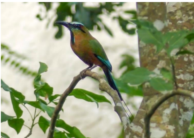
Turquoise-browed Motmot – wow!

I was picked up at the resort at 5am, and Steven explained that it was just him and I on the trip that day, and what the plan was. After a breakfast stop for a baguette and coffee, we drove for around half an hour to our first stop. Steven explained that we would be doing our birding around an archaeological site called Zona Arqueológica de Muyil, starting in the morning by walking round the nearby village, and entering the official site in the afternoon to avoid the worst of the heat. We arrived at the nearby village of Chunyaxché while it was still dark, parked up and stood beside the car listening to the dawn chorus. It sounded as if there were birds everywhere, Melodious Blackbirds were common here, their distinctive song surrounded us. Olive-throated Parakeets were very obvious too, and as the first light started to break, we saw several large flocks of these birds flying around. Soon after first light, I got my first lifer of the day, and it was a spectacular one – a Turquoise-browed Motmot , a species high up on my target list. It posed brilliantly on an overhead wire for a short while, allowing for stunning scope views. Whilst watching it, a Bat Falcon glided overhead, carrying prey, before landing on a nearby radio mast. Two male White-tipped Doves were singing also, one of which was seen well.