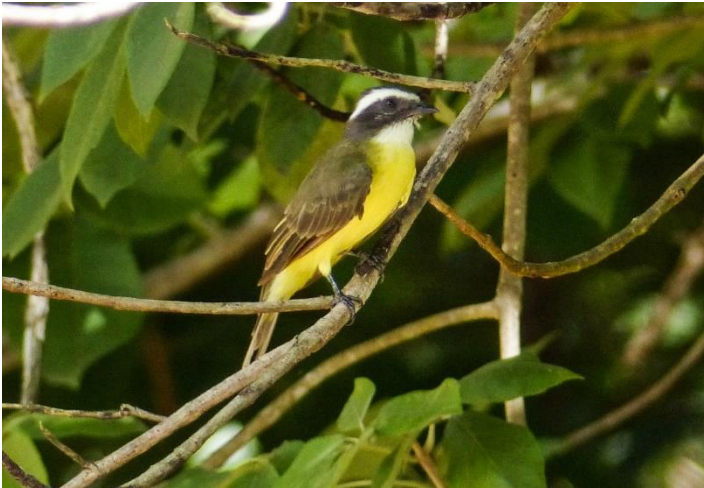
Social Flycatcher – common once you’ve got your eye in with them!

Motmots showed nicely too, Ruddy Ground Doves were evident here, with several on show and flying around, as were White-winged Doves . A pair of Bronzed Cowbirds were seen briefly.