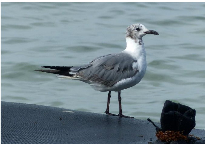
Adult Laughing Gull