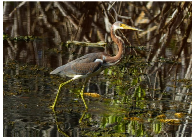
One of two stunning Tricoloured Herons