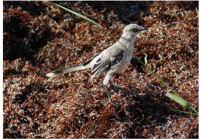
Tropical Mockingbird on the seaweed pile at the resort