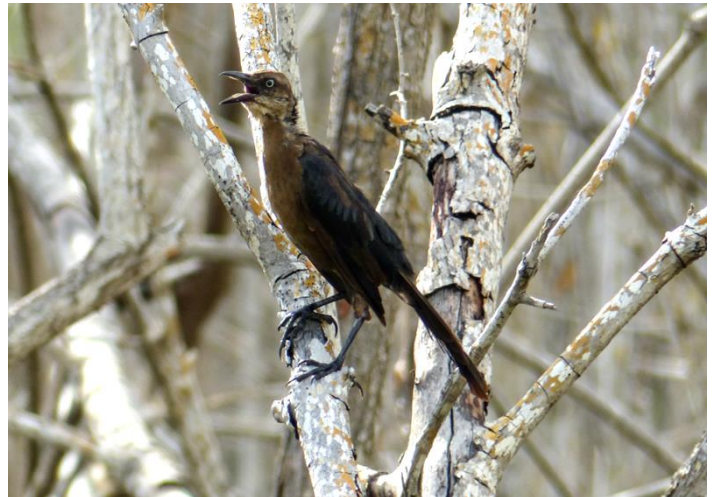
Great-tailed Grackle – the commonest bird!