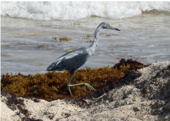
Little Blue Heron on the shoreline

Another fairly quiet day, as I knew I had a long day ahead of me on the 17 th for my guided bird trip day. Similar birding to the day before, but I did have another wander round the swamp behind the resort. A surprise Little Blue Heron flew over my head, and landed nearby on the beach, the only sighting here of the trip. Other than that, it was much the same species-wise, but a White-winged Dove showed very well in the grounds of the resort, and using my experience from the 14 th , I located a Social Flycatcher near one of the viewpoints amongst the Great Kiskadees .