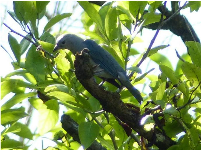
One of a pair of Blue-gray Tanagers

showing off its extraordinary bill, before disappearing. Incredible, bird of the trip! A Lineated Woodpecker showed very well here too, as did a pair of Blue-gray Tanagers , three Groove-billed Ani and a Red-eyed Vireo was seen. We also got lovely views of a Squirrel Cuckoo in the same area shortly afterwards.