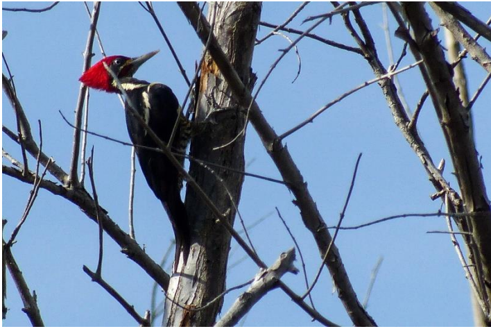
Lineated Woodpecker at the resort