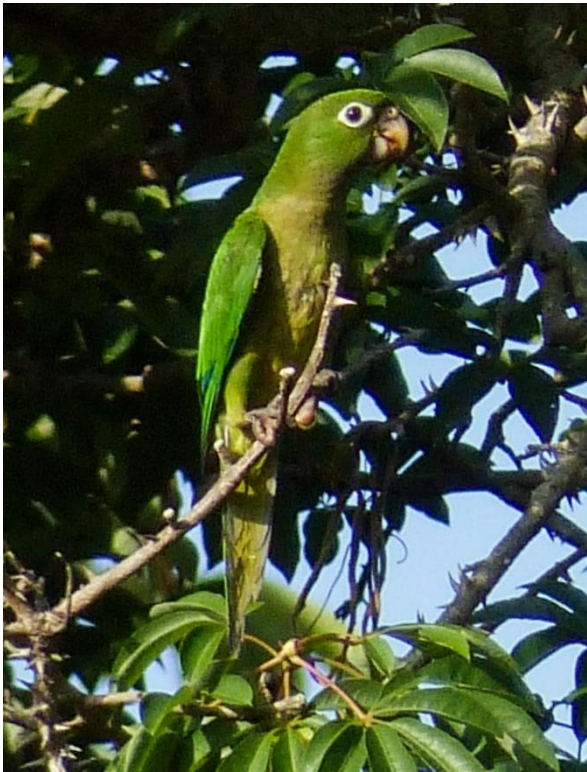
Olive-throated Parakeet – a regular sighting at Chunyaxché