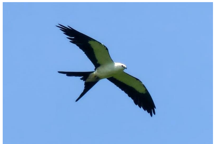
Swallow-tailed Kite – sensational!