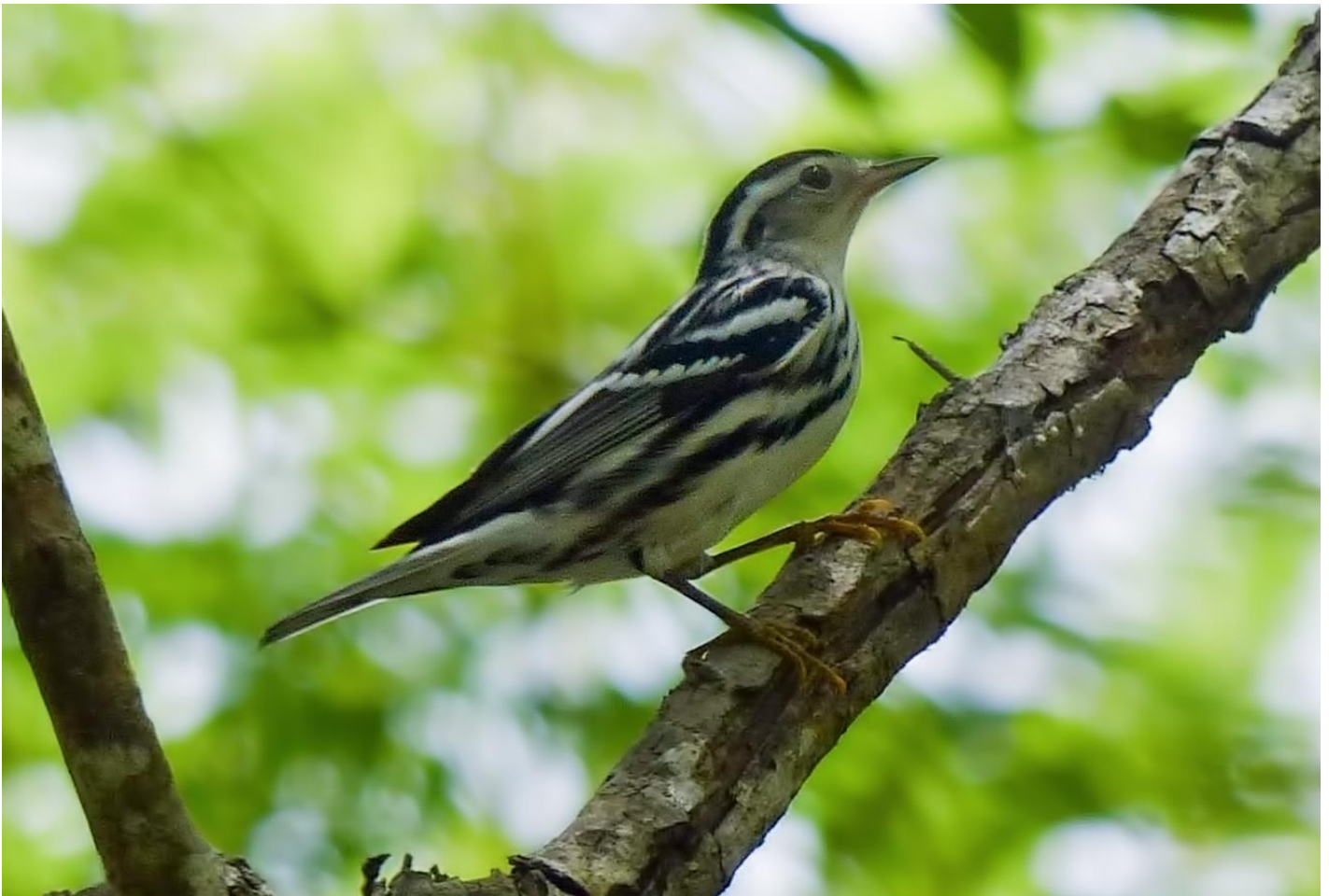
Black-and-white Warbler – stunner!