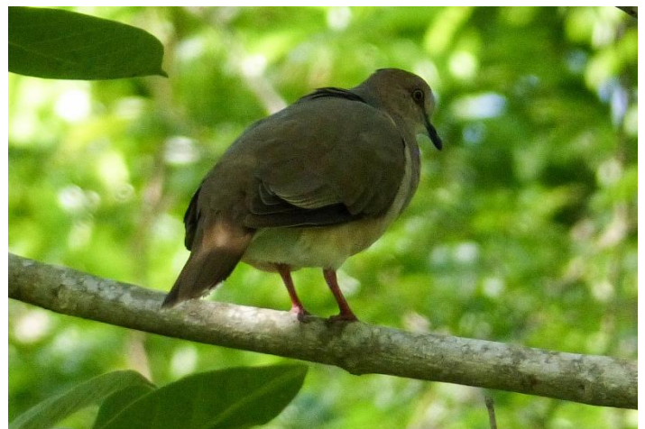
One of two White-tipped Doves

Over the next few minutes, the light started to improve, and several more species became visible. A pair of Scaled Pigeons sat in a nearby tree, which allowed me good scope views, following my unsatisfactory views of this species at the resort a few days earlier. A Red-billed Pigeon flew overhead, as did a flock of 20+ Little Blue Herons . Another lifer followed, and it was another spectacular species, in the form of a pair of Collared Aracari feeding near the path. We started to walk further into the village, through an avenue of trees, where lots of different species were on offer. Remarkably similar to the plumage of the Great Kiskadee, a Boat-billed Flycatcher showed well here briefly, this was my only sighting of this species on the trip. Other additions to my list here were Clay-colored Thrush , Ladder-backed Woodpecker and Yellow-throated Euphonia . We reached a clearing amongst a dense area of woodland, and we picked up the first Yellow-green Vireo and Sulphur-bellied Flycatcher – both of which turned out to be fairly common here, Social Flycatchers were very common too. A large patch of pink Salvia was attractive to Hummingbirds, and to my delight, we saw several here – White-bellied Emerald was the most numerous with at least four birds seen, but Steven also picked up a single Wedge-tailed Sabrewing that visited briefly. There was also a singing male Spot-breasted Wren here, which we got nice views of in the end. A further two Turquoise-browed