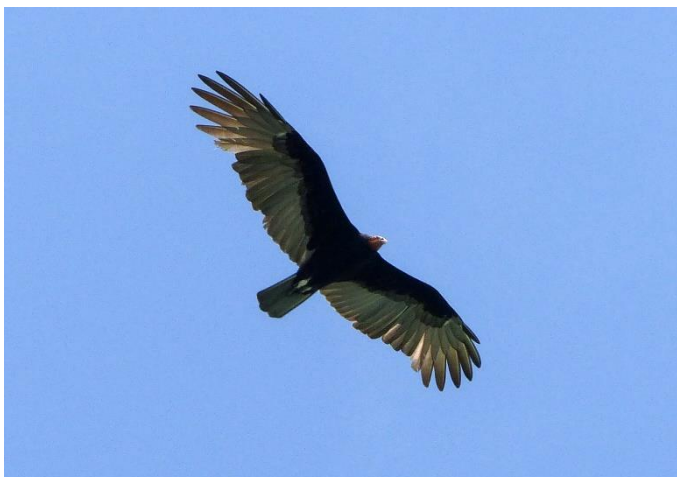
Lesser Yellow-headed Vulture