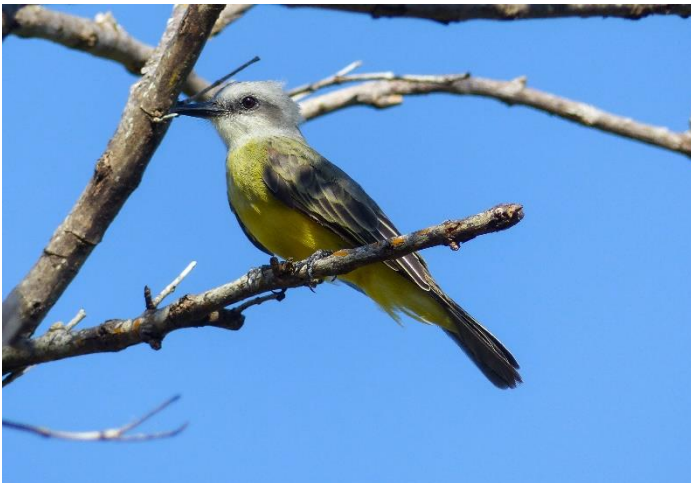
One of two Couch's Kingbirds at the resort

The next day was largely much of the same, without the excitement of any colourful warblers. A Least Tern was fishing in the resort bay briefly on the morning, which was the only one I saw on the trip. Another species of note was a pair of Couch's Kingbirds that I picked up on call around the swamp viewpoint, thanks to Steven for his tips on picking up this species. I also heard Tropical Kingbirds in the same area, so these two species are often both present, but impossible to separate without vocals. A family party of Hooded Orioles showed very well here for a short time.