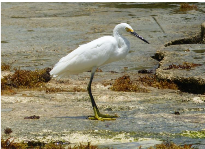
Snowy Egret on the coastline at the resort

Similarly to the day before, I couldn't sleep and was up and about early. This time, I decided to have a wander around to see if I could find any more habitat on the boundaries of the resort. Although I didn't find any on this day, I could hear lots of activity behind a large row of trees next to our apartment, which sounded like marsh/swamp-type habitat, but I couldn't find a way in at this point. Instead, I headed to the beach again, and there was a notable passage of hirundines heading south over the resort. The majority of the birds were Cave Swallows , but there was also a good number of Purple Martins going over, as well as several lingering Vaux's Swifts , and the occasional Barn Swallow . These species were all seen pretty regularly after this. The regular beach birds were also seen over breakfast, being joined by a Least Sandpiper which I saw on and off over the duration of the trip with the Turnstones. A Snowy Egret was seen here for the first time on the trip.