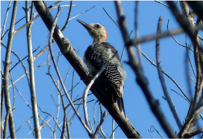
Golden-fronted Woodpecker outside the apartment

Kingbirds were flycatching, as well as a Great Kiskadee . Looking out from the viewpoint, I picked up two adult American White Ibis flying over the swamp, which circled before landing out of sight. From here, I also came across my first Tropical Mockingbirds of the trip, as a family party of four were feeding on the seaweed that had been dumped. Elated that I had managed to find this habitat, I walked on to find another viewpoint, which overlooked a gated-off forest area which was not part of the resort. From here, I picked up several new species including White-winged Doves sitting at the tops of the trees, a stunning Lineated Woodpecker , a flock of 10 Olive-throated Parakeets flew through, and I picked up a distant adult Yucatan Jay which I had been keen to see, as they are endemic to the region. Generally, the birds were distant from here, but a brilliant bit of habitat. Wandering slowly back to the apartment, I was stopped in my tracks by a pair of Golden-fronted Woodpeckers , that posed nicely for photos. I was excited to explore my 'new patch' further, but honeymoon duties called, and we headed for breakfast, again seeing the usual suspects from the beach.