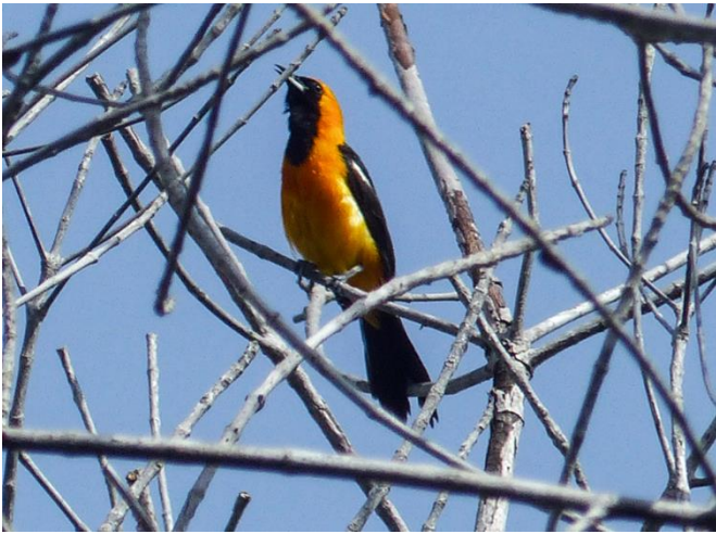
Male Hooded Oriole

which despite being common throughout the trip on the coast, were always impressive and most welcome. A few more 'familiar' birds were also seen including Brown Pelican , Laughing Gulls , Osprey , Ruddy Turnstone , Sanderling and Sandwich Terns , again all seen daily from here. Getting to grips with the resort, and exploring the bars and restaurants didn't produce anything new for the rest of the day!