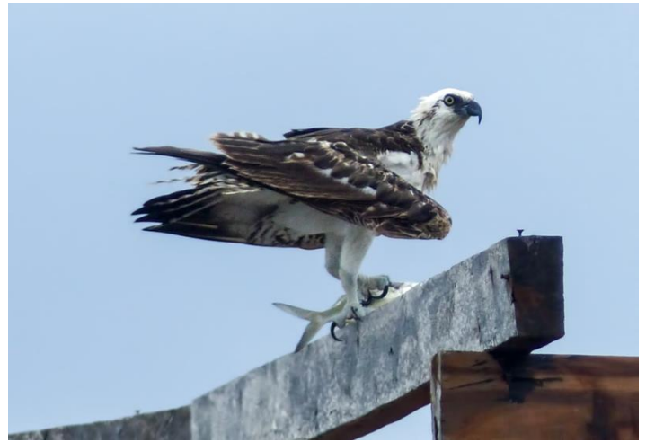
The friendly resort Osprey