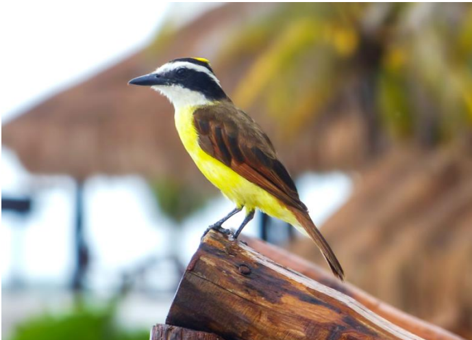
Great Kiskadee – very common in most habitats

As we arrived at the first drop-off point, I managed to see a few more species. A small group of Cave Swallows circled around the reception area, as did another Turkey Vulture , and several more Grackles were present. As we pulled away, a brightly-coloured bird flew across the road in front of us, and perched on a nearby palm tree – this was my first Great Kiskadee of the trip, a species that turned out to be very common around our resort. It was late when we arrived at our resort, so there was nothing more of note seen.