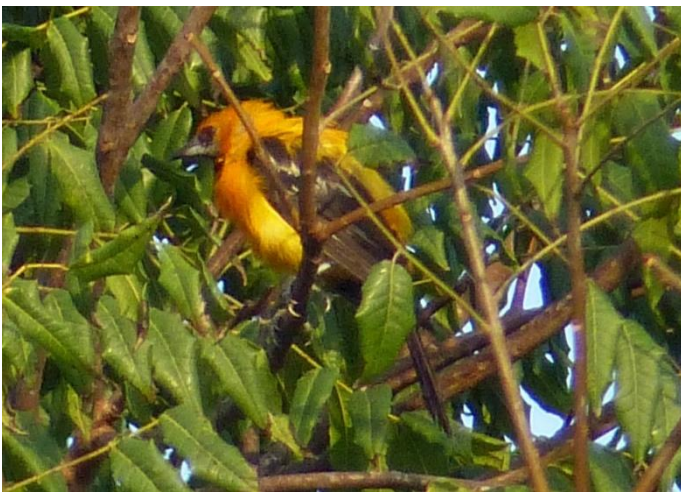
The endemic Orange Oriole

Steven then picked up another target of mine on call, a Yucatan Woodpecker pair which eventually showed well in the scope, another endemic to the region. This endemic was quickly followed by another, when I picked up an Oriole sp. which was soon confirmed as a male Orange Oriole , another of my target species ticked off. We concentrated on Orioles for a short while, as they were very common here (especially Hooded Oriole ). Steven told me there were six species found in this area, before promptly showing me both Altamira Oriole and Black-cowled Oriole in quick succession. We also saw the first of many Cinnamon-bellied Saltators here, and also a single of their less common cousin, Black-headed Saltator . Interestingly, the only two Black Vultures I saw on the trip were seen here.