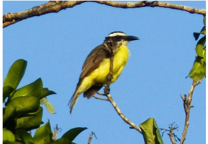
Boat-billed Flycatcher – very similar to Great Kiskadee, but much rarer

Steven then picked up another target of mine on call, a Yucatan Woodpecker pair which eventually showed well in the scope, another endemic to the region. This endemic was quickly followed by another, when I picked up an Oriole sp. which was soon confirmed as a male Orange Oriole , another of my target species ticked off. We concentrated on Orioles for a short while, as they were very common here (especially Hooded Oriole ). Steven told me there were six species found in this area, before promptly showing me both Altamira Oriole and Black-cowled Oriole in quick succession. We also saw the first of many Cinnamon-bellied Saltators here, and also a single of their less common cousin, Black-headed Saltator . Interestingly, the only two Black Vultures I saw on the trip were seen here.