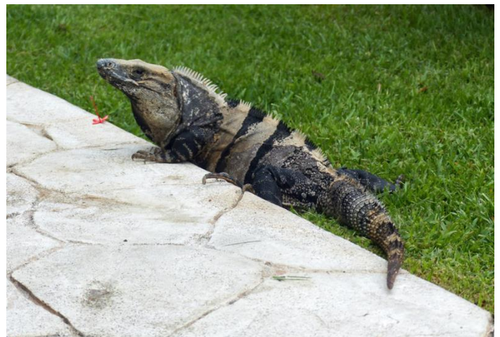
Spiny-tailed Iguana on the grass beside the reception