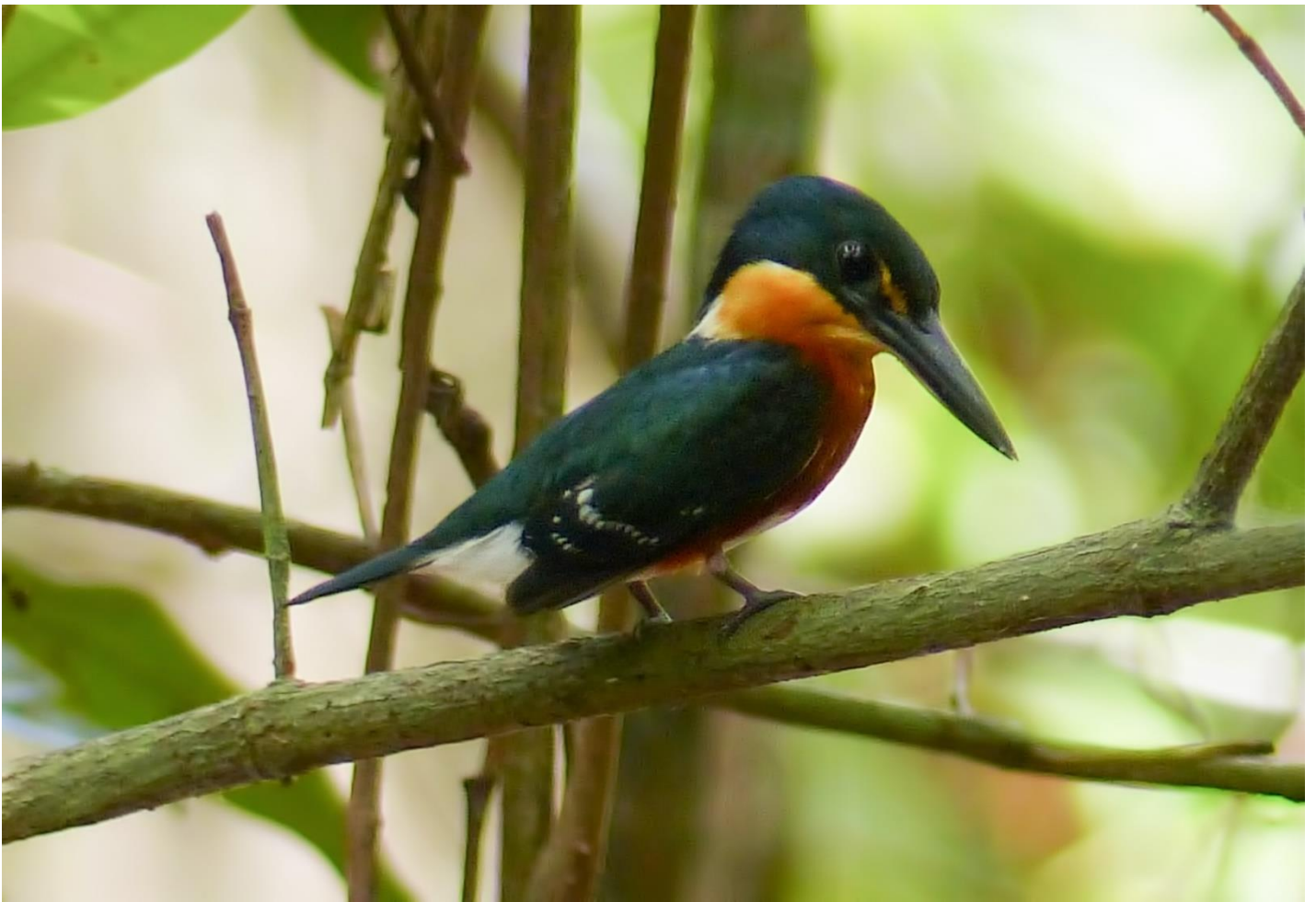
American Pygmy Kingfisher – wow!