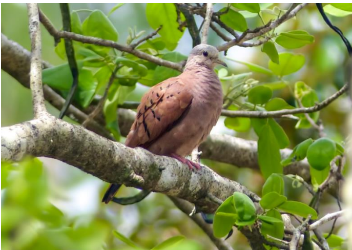
Ruddy Ground Dove – lovely little bird, one of my favourites of the trip

Back to the coach, and we headed off for some lunch to a small Mayan village about an hour from Chichén Itzá called Yalcobá. We had some lunch, before having a wander round the village. The birding was very busy, one of the first birds I saw was a Ruddy Ground Dove on a nearby overhead wire, very bonny little birds. I then saw a further two in a nearby tree, which posed nicely for photos. I had some nice looks at five Groove-billed Ani here too, which I initially presumed were more Grackles , but when they called it was much different, and encouraged me to take a second look. As we wandered round, I picked up another species that turned out to be very common around the village, and a species that I had read about – Social Flycatcher . Very similar in colour to the Great Kiskadee, but smaller and very 'busy' like a typical Flycatcher. The only other addition to my list here was a single Tropical Pewee that was flycatching from a length of barbed wire, this turned out to be my only encounter with this species on the trip. After having a swim in a nearby cenote, we headed back to the resort, arriving back about 6pm. It's a great day out to Chichén Itzá, and well worth doing, but it's a long day!